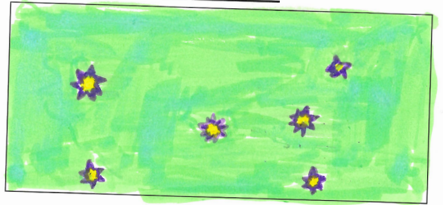
Plant Name: ice plant